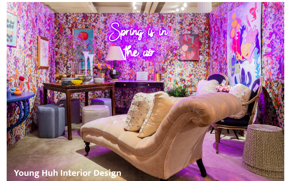
Young Huh Interior Design