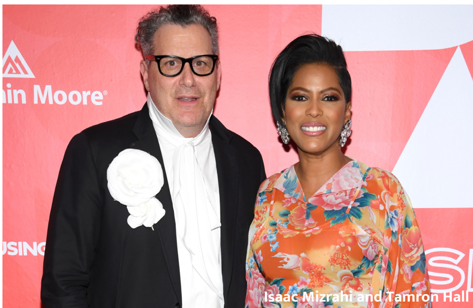
Isaac Mizrahi and Tamron Hall