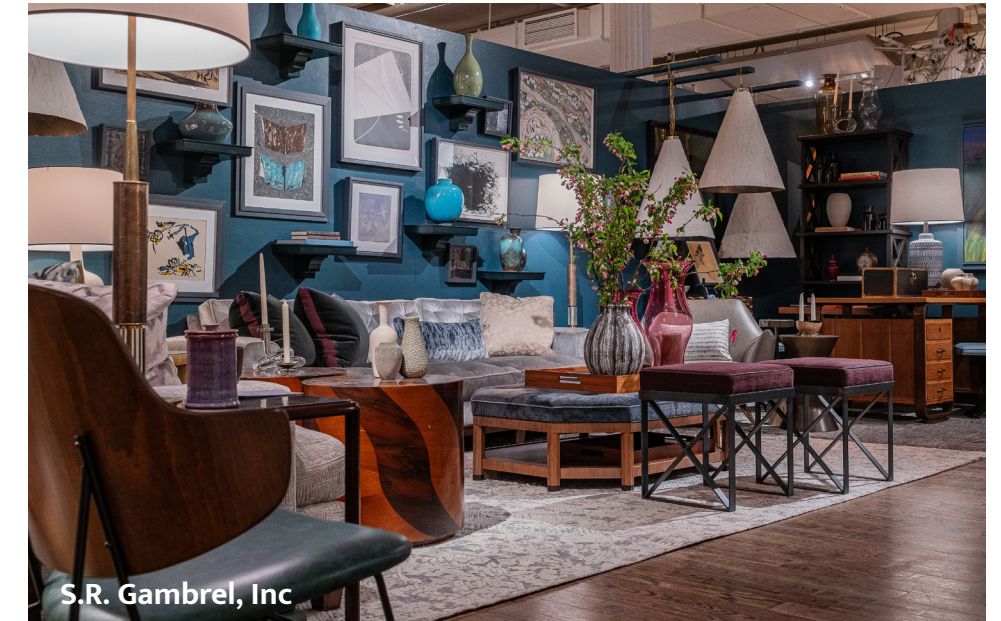
S.R. Gambrel, Inc